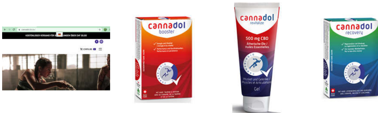
Image: Creso Pharma's new e-commerce channel and 'Born to move' range'

The launch of the Company's e-commerce channel marks a strategic milestone and will complement initiatives being undertaken targeting traditional retail sales. The Company is confident that the new initiative will provide access to a range of new consumers and assist the Company to broaden its footprint in Switzerland and eventually Europe.