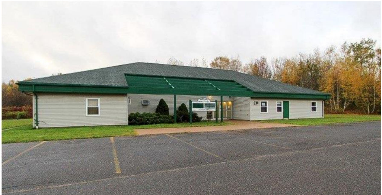
Image: Halucenex's 6,000 sq ft medical treatment centre in Nova Scotia, Canada

Halucenex currently operates at 6,000 sq. ft. medical treatment facility in Nova Scotia, Canada, located next to the Hants Emergency Hospital, with a Controlled Substances laboratory, and 18 treatment rooms dedicated to providing psychedelic-assisted psychotherapy.