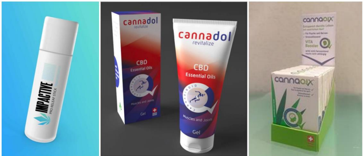
Images: ImpACTIVE pro relief roller stick, cannadol® 0.5% and 1% in 100mL gel tubes and CannaQIX10®