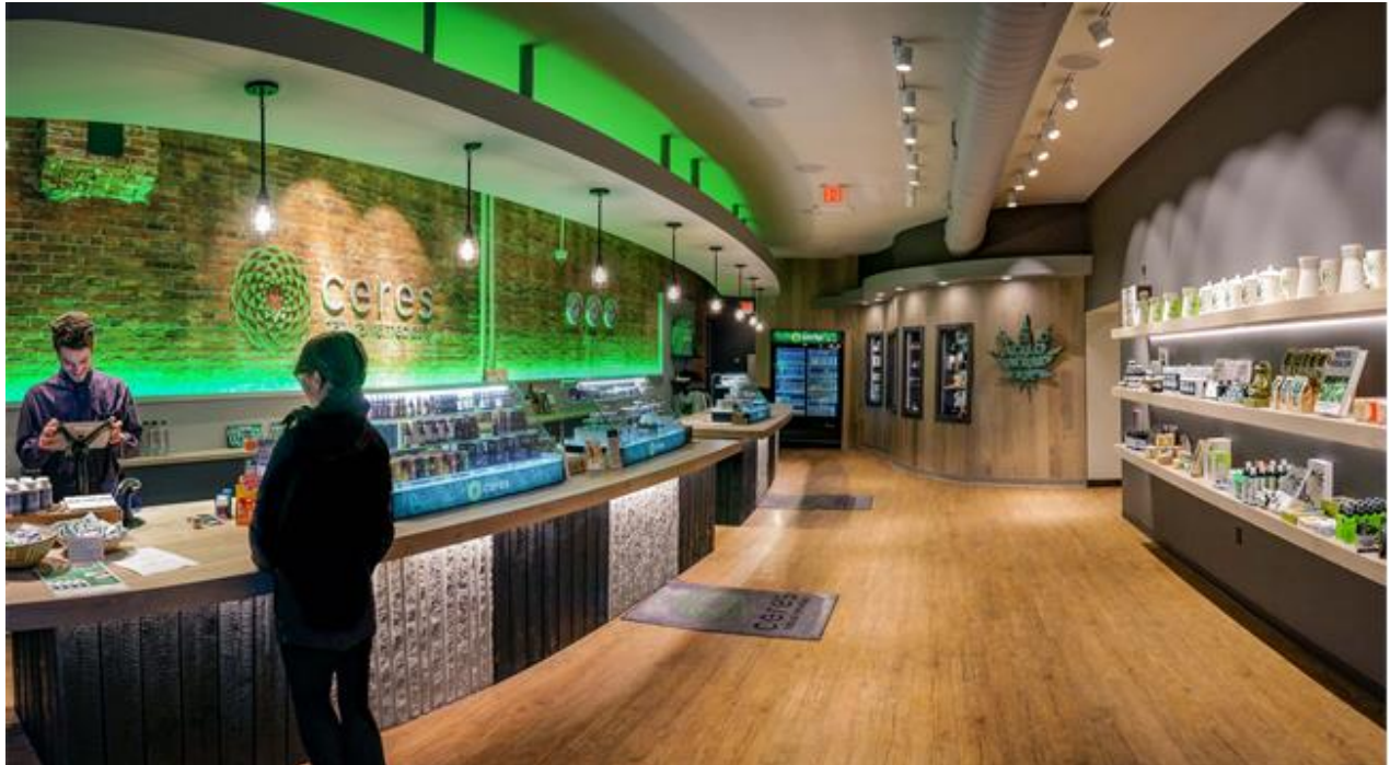
Image: CERES Natural Remedies Flagship store, Vermont USA