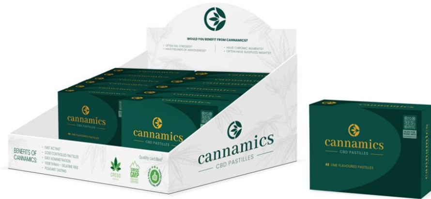
Image: Cannamics product and display packaging