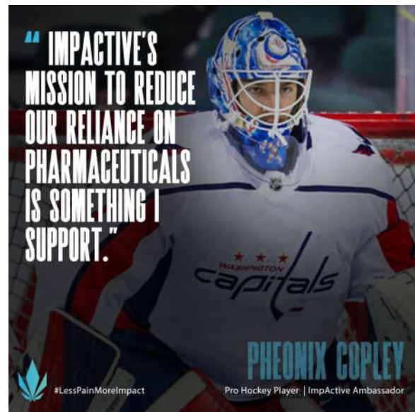
Images: ImpACTIVE marketing collateral and brand ambassadors