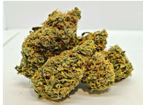
Figures 2-3: (L-R): Mernova's PG-13 and Lemon Haze products utilizing the new post-harvest processes