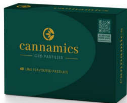
Figure 1: Cannamics product packaging

Pharma Dynamics - a subsidiary of Lupin Limited (NSE:LUPIN) - is a leading pharmaceutical company in South Africa, and is ranked the fifth biggest generic pharmaceutical company in South Africa. Pharma Dynamics leads with high quality generics at affordable prices and is well-known for its investments into innovative wellness programs towards holistic healthcare.