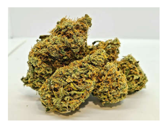
Figures 2-3: (L-R): Mernova's PG-13 and Lemon Haze products utilizing the new post-harvest processes